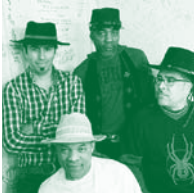
The Reggae Cowboys – www.reggaecowboys.com